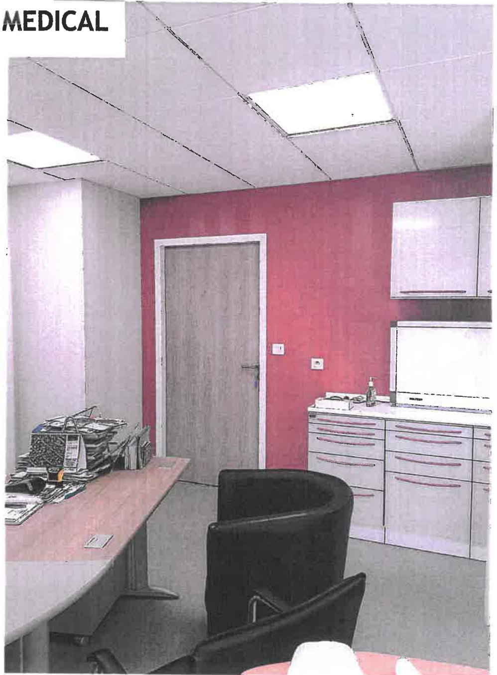
BUREAU DU MEDECIN